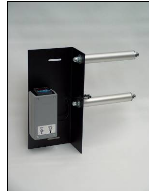
INSP-1 Inspection Fixture Bracket Assembly with optional PC-1 Preset Counter

Remove all parts from the shipping container and verify contents