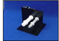
Model COUNT-100 Label Counter for webs up to 170mm (6.5"). COUNT-200 has similar appearance, and handles label webs up to 255mm (10") wide.

The PC-1 Label Counter is a popular option on our S-100 and S-200 Label Slitters . Many times, however, users don't need to slit labels, just count them. To save users money, LABELMATE has introduced two Label Counters and Counting Stations based on the S-100 and S-200 Slitter chassis but without the Slitter function. The COUNT-100 and COUNT-200 will handle label webs up to 170 mm and 255 mm (6.5- and 10-inches) wide respectively. A CAT-2 Rewinder pulls the labels through the counter. The versatile Counters can be used at the output of a printer, or can be used with an Unwinder and a CAT-2 Rewinder to form a stand-alone off-line label inspection / counting station.