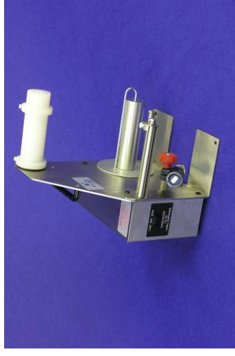
LD-100-RS-SS Label Dispenser