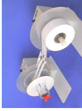
The BURST-180 Burster Bar is shown installed on a CAT-2-CHUCK Rewinder in optional Off-Line use with a UCAT-1 Label Unwinder.