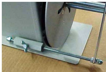
Detail of Guide Arm Mounting