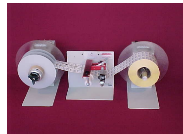
Complete SLIT-100 Package