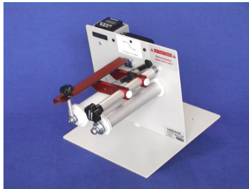
S-100 with PC-1 Counter